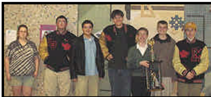
Scholastic Division Champions Mahomet-Seymour