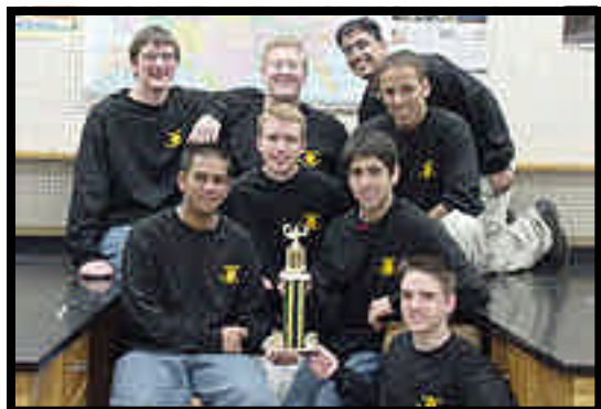
Champions – Glenbard North