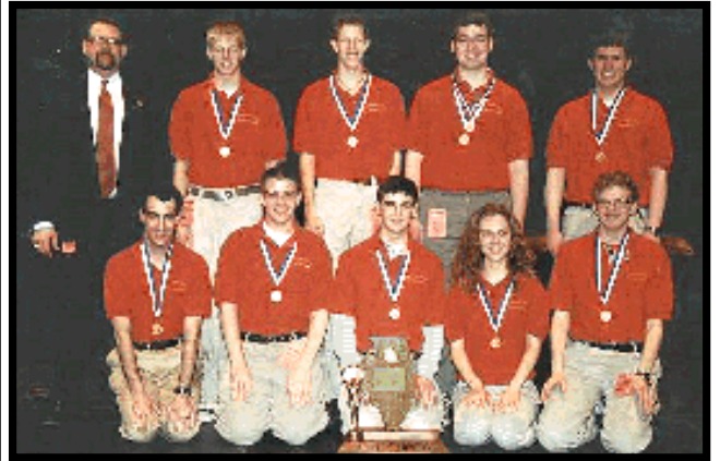
Warrensburg-Latham HS, IHSA Class A Champs

In hindsight, I realize that this team was a once-in-a-lifetime group, brought together by luck and built over a four-year period. I also feel that every school in Illinois has good potential scholastic bowlers walking its hallways. The key is to actively recruit the younger kids into your program and be patient as they develop. Our program will struggle to replace this special group of seniors, but a sound program will always have trained players ready to step in and keep the ball rolling.