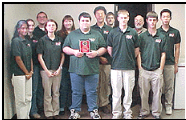
The Salem Community HS team after the Kickoff Tournament

Finishing the season with a 51-3 record was a tribute to the dedication and hard work exhibited by this team. They have set a high mark for future teams to shoot for.