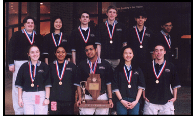
Illinois Math & Science Academy, IHSA Class AA Champs