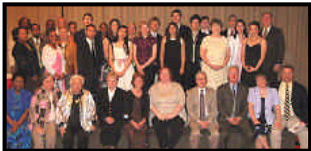
Students and Family Members from Decatur Lutheran