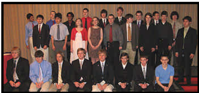
All-State Scholastic Bowl Players 2007