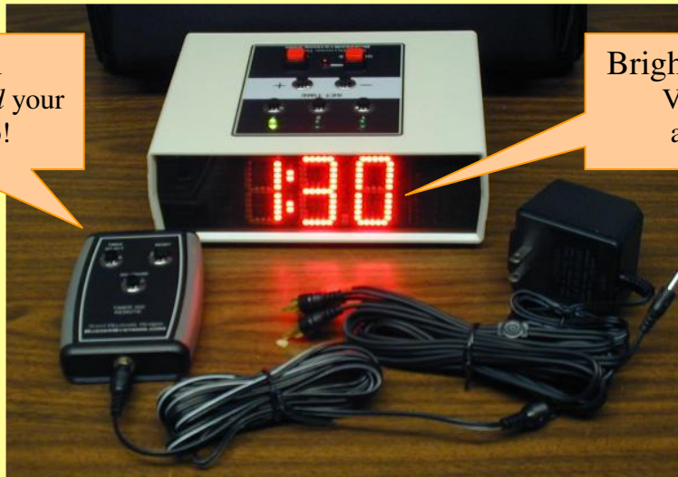
The Timer 300 from Novel Electronics (carry case not shown)

Bright, 2-inch digits Visible across a large room