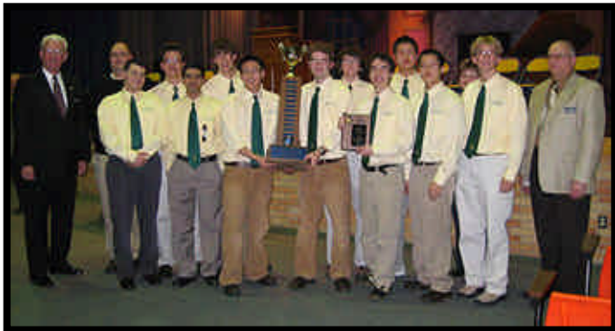
The Vikings from Fremd

This brings me to the other component of our team that I feel most represents us. We were, through and through, a team. Each one of our five starting members, and at times, other key players, contributed to the team. There was no one superstar. Though we had two First-Team All-State players, it took a complete team effort to get us to where we were. Each member contributed evenly, and each of us had to carry the team on a different occasion, but there was always someone there to step up and lead us to victory.