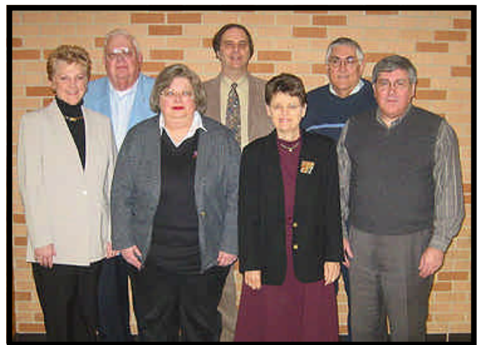
Scholastic Bowl Hall of Fame Inaugural Class

The IHSSBCA is now beginning to consider who should be in our second Hall Of Fame class. We had a great group selected last year. We will only induct four people this year and are hopeful we can maintain our standard of excellence. In order to make a good selection, we need the input of many coaches.